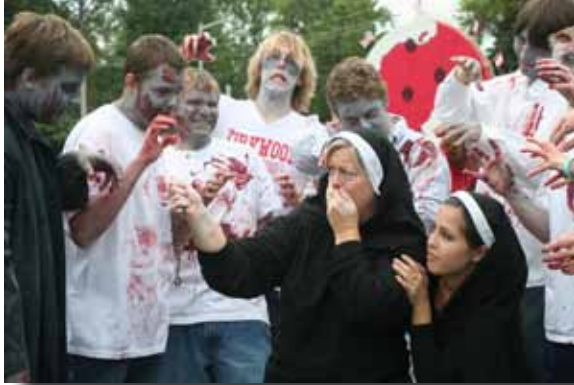
Zombies & Nuns